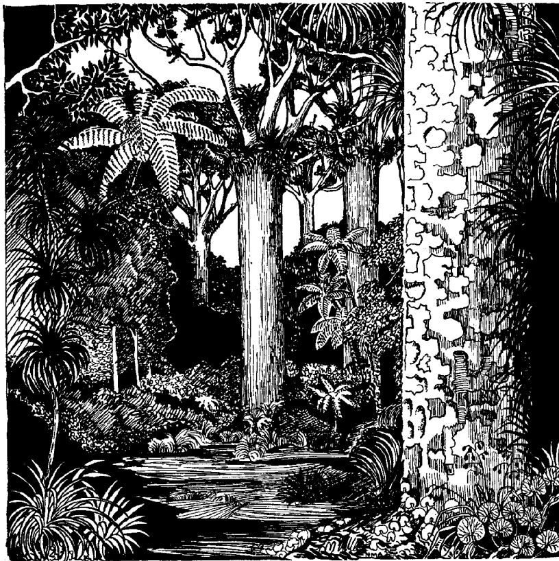
Kauri forest, Auckland, by N M Adams, from Trees and Shrubs of New Zealand , published by R E Owen, Government Printer, Wellington, 1963.