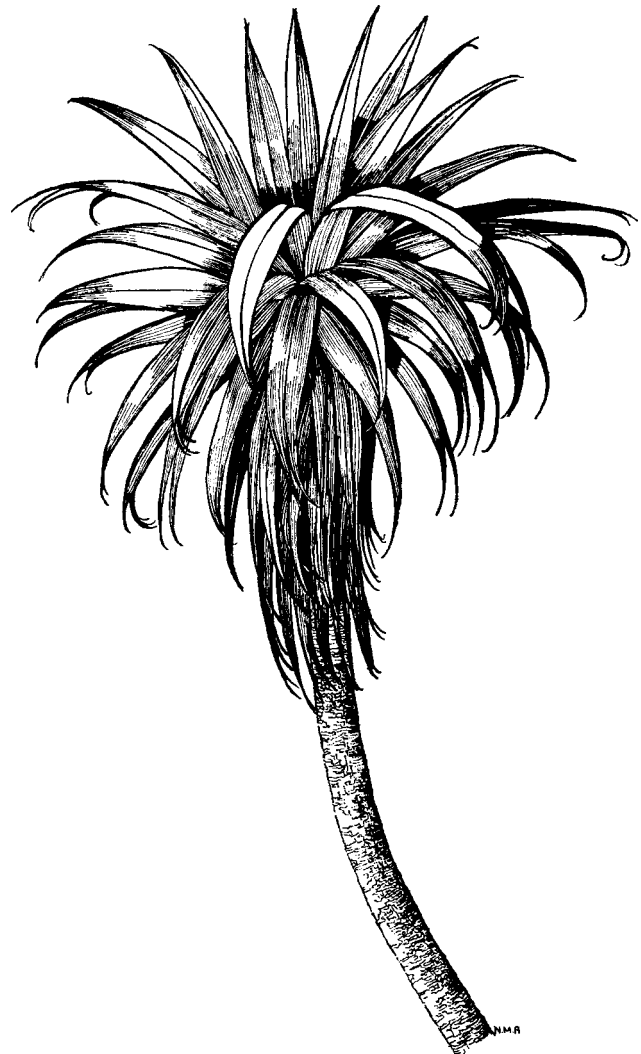
Toi – broad-leaved cabbage tree. N M Adams.