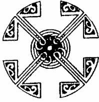
Wainuiomata Marae Family Support Service